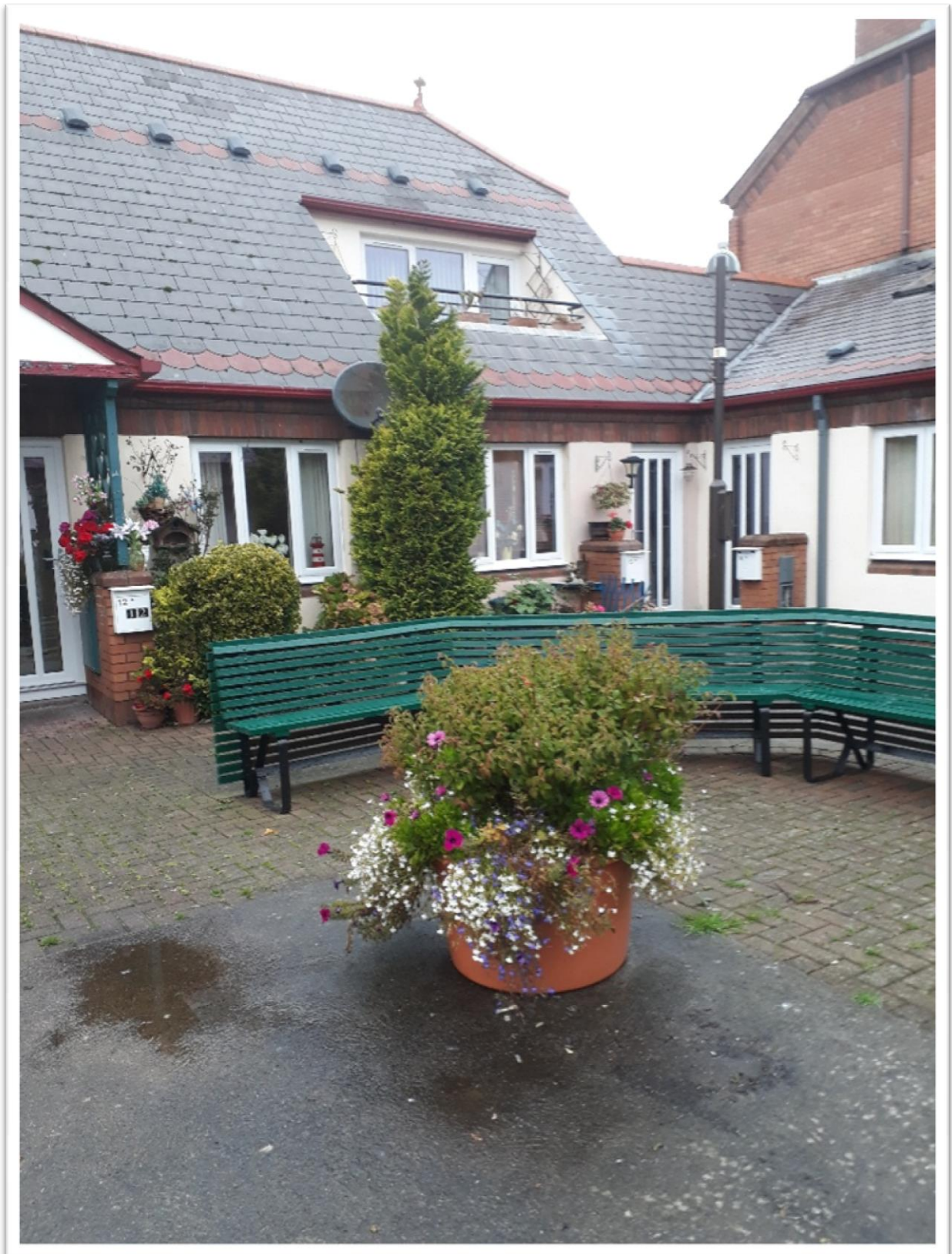
The two public benches in the forecourt have been painted and a new resin based surface has been laid at the entrance. New planters have been delivered and we are currently awaiting quotes for the upgrading of the cobble-lock surface at the rear of the complex.