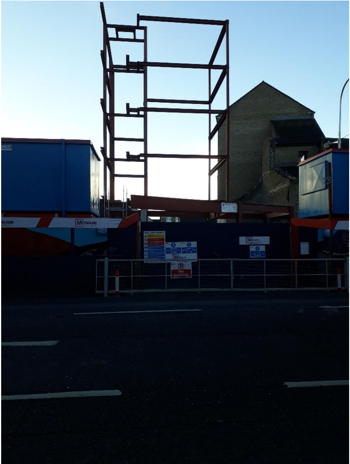
Brendan Behan Older Persons complex: